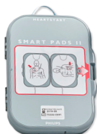
HEARTSTART SMART PADS II